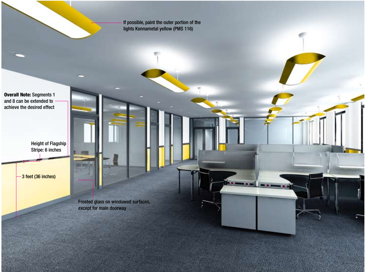
Open Office (2nd Floor)